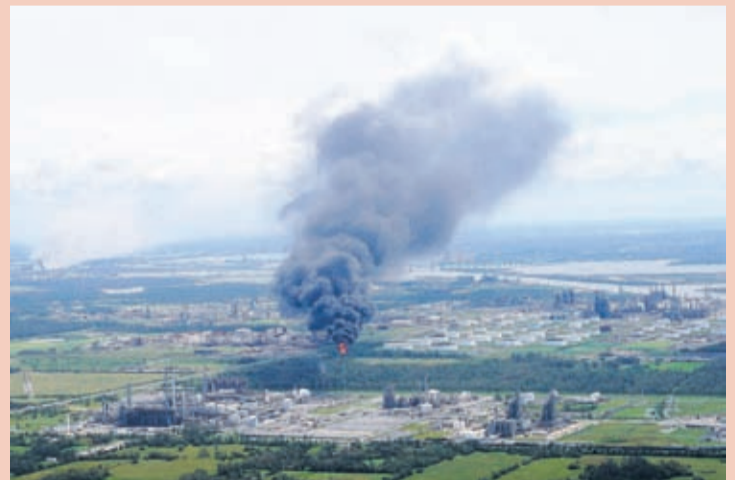
A chemical fire burns at a facility during the aftermath of Hurricane Laura Thursday, Aug. 27, 2020, near Lake Charles, La.